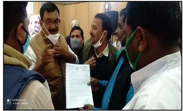
Meeting with Farmers on FRA