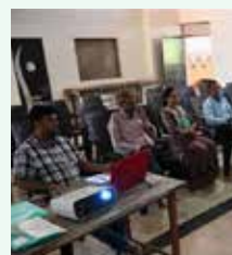
Use of digital platforms such as WhatsApp, YouTube, and Google Search for livelihood and learning