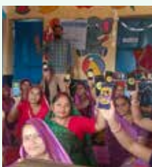
Smartphone usage and internet safety

Through a trained network of 330 “Internet Saathis”, MJVS delivered digital education across more than 1,300 villages in 11 blocks of Mandla and Dindori districts. Each Member conducted door-to-door outreach as well as group learning sessions, ensuring inclusive and practical learning.