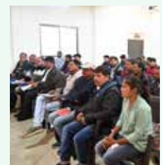
Digital payments, online banking, and rural e-commerce

This programme transformed digital access from an individual facility into a shared community resource, especially supporting women who had not previously received formal education.