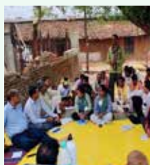
Online access to government services (education, health, and public welfare schemes)